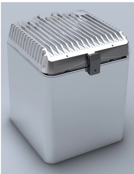
Neat storage of head for protection in rental deployment and storage